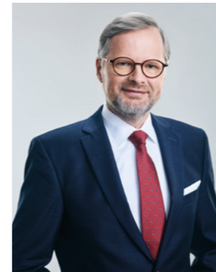
Petr Fiala Prime Minister of the Czech Republic