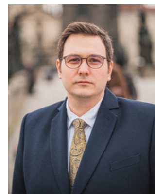
Jan Lipavský Minister of Foreign Affairs of the Czech Republic