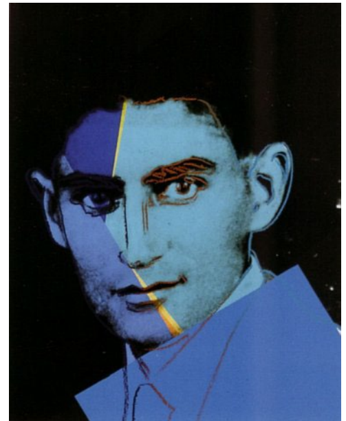
Andy Warhol: Franz Kafka, 1980, from Ten Portraits of Jews of the Twentieth Century portfolio